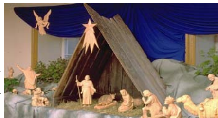
Nativity scene in the church of Saint-Jean-Port-Joli in carved wood.

Little by little, according to the Franciscan tradition is spreading, under the influence of Franciscan preachers, especially in Franciscan oratories in Italy. In the form of living nativity scenes, but also nativity scenes made with large wooden or clay figurines that could be exhibited for a longer time.