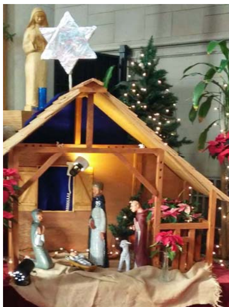
Nativity scene at the Saint-Jean-Baptiste church in Ottawa, character from the years 1955 by an artist from Quebec. See Saint-Francis on the right.

In Canada, the first church cribs representing the Nativity with its characters existing since the beginnings of the colony. It is obviously the religious communities, originating in France, who implanted this tradition with us. In our houses it is customary to make a Christmas tree and some had a crib at the foot of the tree. At home, my father set up a nativity scene with illuminated houses and the stable with baby Jesus.